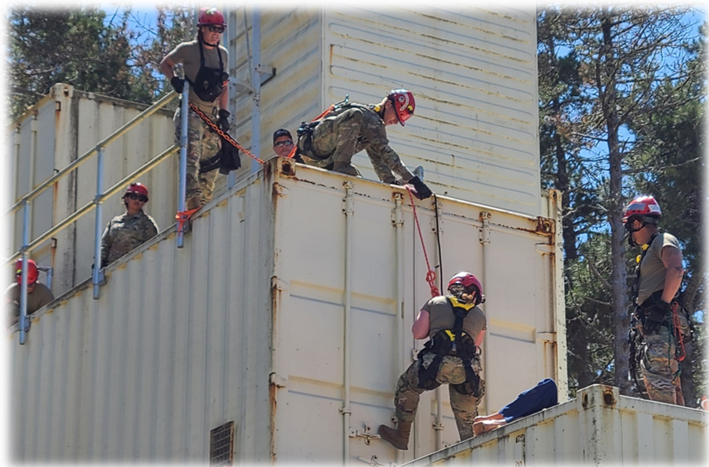
Colorado National Guard members of the Chemical, Biological, Radiological and Nuclear Enhanced Response Force Package rappel down a structure to practice search and rescue techniques. The team performed their external evaluation at Camp Rilea, Astoria, Oregon, July 9-17, 2022.